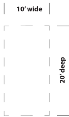
Single booth space